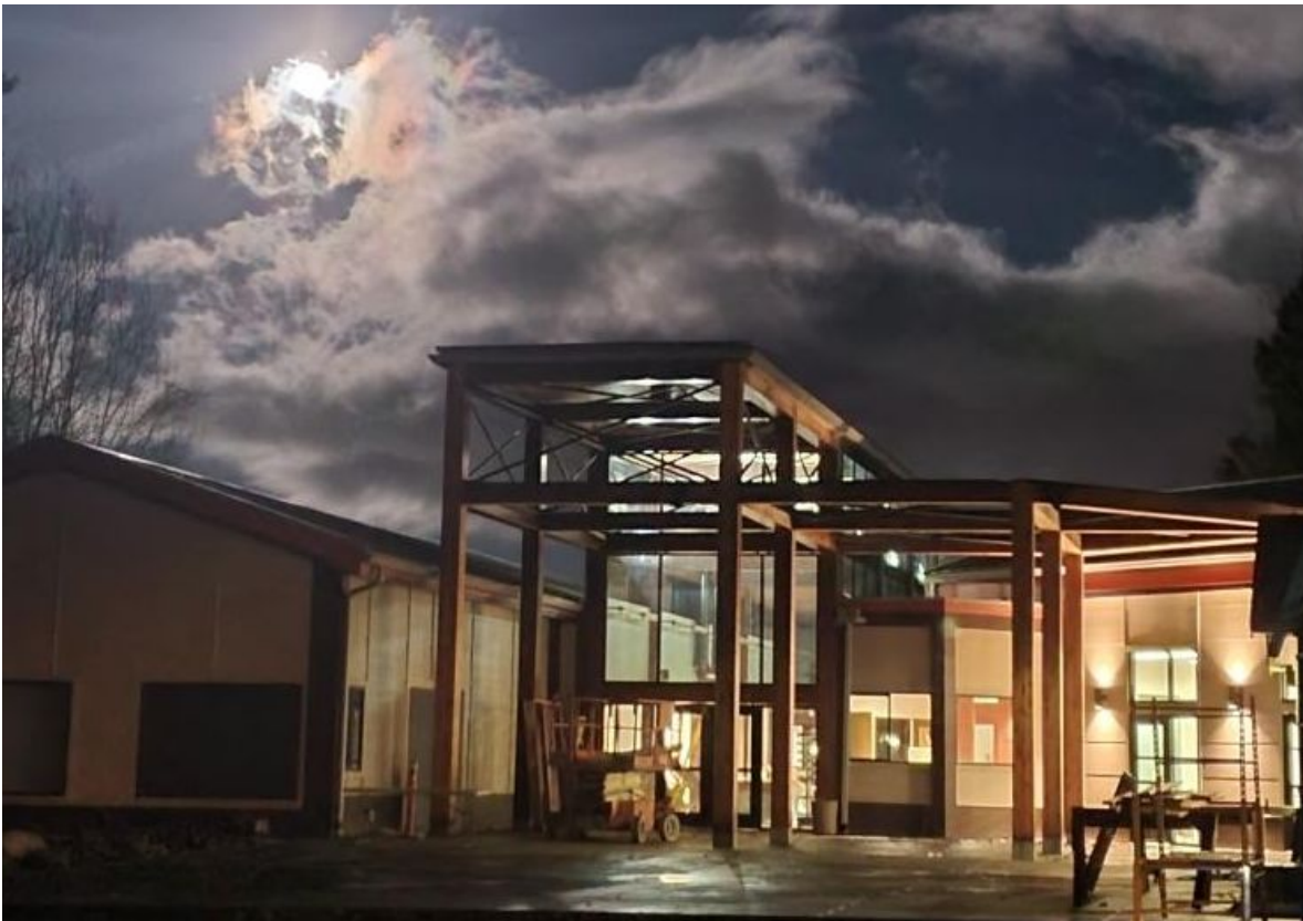
The River Center under construction in November 2021

A YEAR OF INNOVATION & CONSTRUCTION WHILE THE COVID PANDEMIC CLOSED DOWN THE COUNTRY