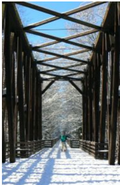
Railroad Bridge after first snow.