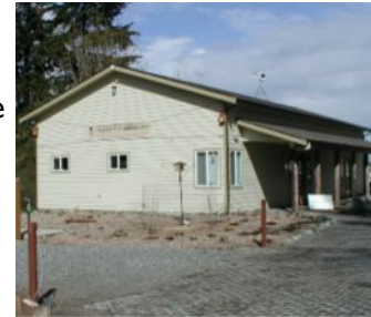
Look how we've grown since 2002.